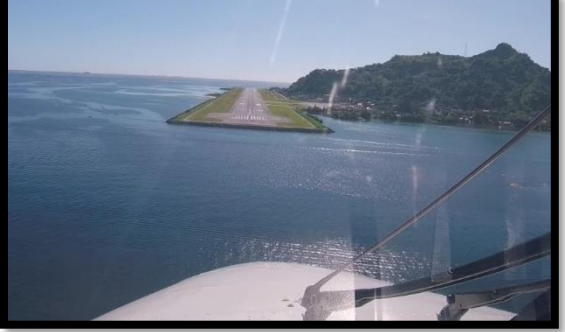
Landing in Chuuk after first leg home.