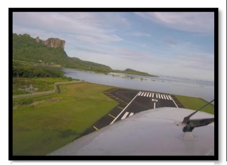
Departing Pohnpei on my way home.