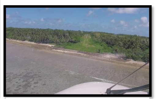
Landing in Woleai on the way home.

We thank you all for your continued support, prayers and encouragement, especially during this time of uncertainty in the world. You are a blessing to us, AND to the people of Yap. These remote islands are very dependent on our flights to bring them hope, whether it is by bringing supplies, carrying out their sick, or transporting people where they need to go. We enjoy a close relationship with the island communities and have become part of the family. We believe that relationships are key for opening the door to evangelism. We have seen many doors open, due to the years of service that PMA has provided here in the islands. Pray that He continues to open doors and touch people's lives.